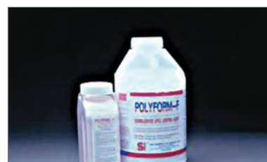
Liquid Spill Lock Formaldehyde Neutraliser