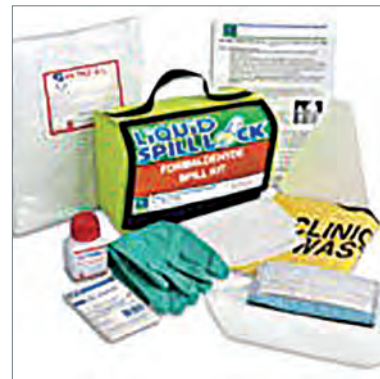
Liquid Spill Lock Formaldehyde Spill Kit

1 - FAN PAD GLTM, Formaldehyde Neutralising Pad super absorbent pads and sheets, specially treated with Formalex® for the ultimate destruction of formaldehyde, 10% formalin and glutaraldehyde solutions and eliminate their hazardous vapors. Absorbs & neutralises up to 900cc of 10% formalin.