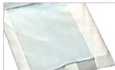
Formaldehyde Neutralising Pads