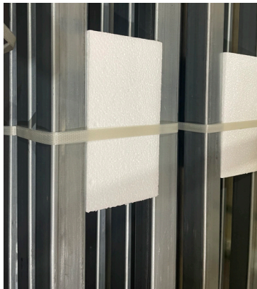
Packed in a bundle of 4

Ratcheting cargo bars are suitable for horizontal and vertical applications. Great for use in reefer and standard shipping containers where F-Track isn't available.