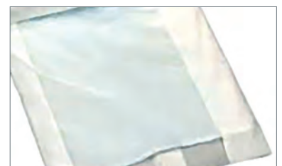
Formaldehyde Neutralising Pads