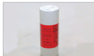
Merksorb Indicator Powder