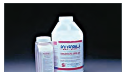
Liquid Spill Lock Formaldehyde Neutraliser